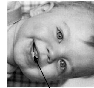
1 st Baby Tooth in at approx. 6 months Full Set Baby Teeth = 20 (approx. 2½ - 3yrs)